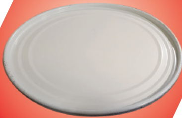
Double Re-enforcement Ring Cover with no plugs or fittings